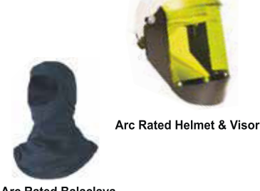
Arc Rated Balaclava